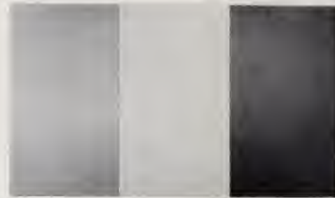
Brice Marden, Summer Table , 1972

Minimalism's practitioners were many artists who still sought to express emotion, though within reductive formats. They knew that the Minimalist dialectic made the committed viewer much more aware of minute distinctions. For example, the obsessive grid in an Agnes Martin painting maintains its vital individuality through slight, clearly handmade, variations in execution and through the particularities of the canvas weave: these little denials of the painting's seemingly omnipotent structure created its transcendent power. As Morris observed, "Simplicity of shape does not necessarily equate with simplicity of experience." As Brice Marden explained even more expansively, "Within these smaller confines, confines which I have painted myself into and intend to explore with no regrets, I try to give the viewer something to which he will react subjectively. I believe these are highly emotional paintings not to be admired for any technical or intellectual reason but to be felt." In Marden's Summer Table , the painting's panels convey for him the memory of glasses of cool liquid on a table in the garden of a house on a Greek island where he had spent the summer. The light there was